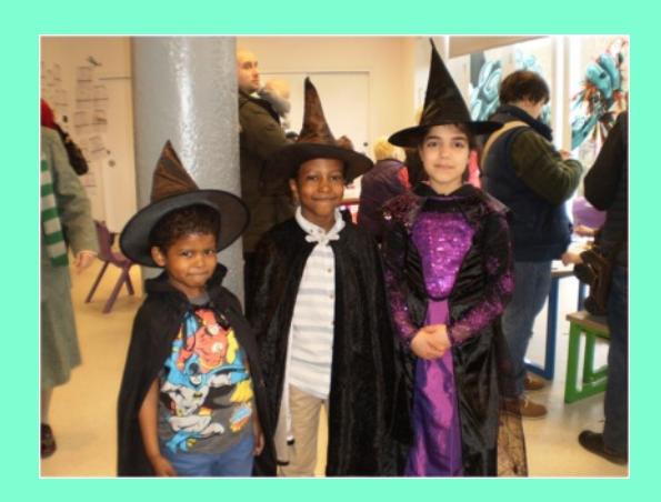
DRESSING UP AS WIZARDS AND WITCHES