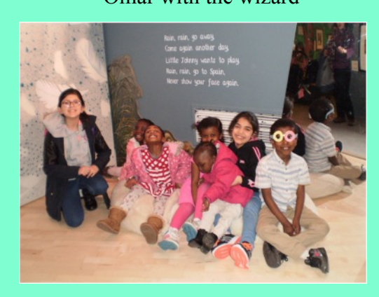
RHYME AROUND THE WORLD